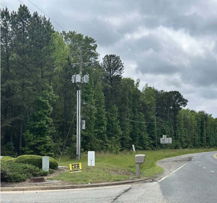
Massaponax Church Road View

MASSAPONAX CHURCH ROAD LOT 5110 Massaponax Church Rd Fredericksburg, VA 22407