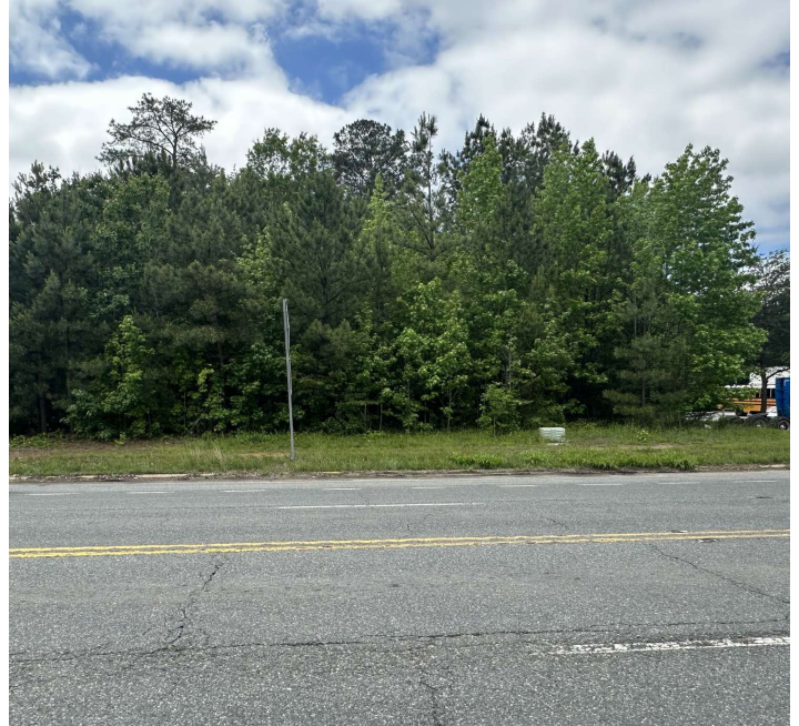
Patriot Hwy View