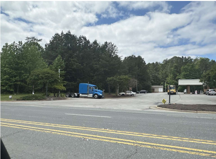
Patriot Hwy Access