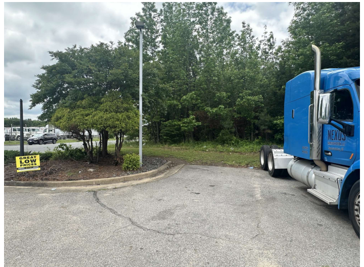
Patriot Hwy Access