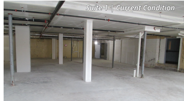
Suite 1 | Current Condition