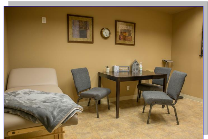
Main hallway with built-ins and break room.