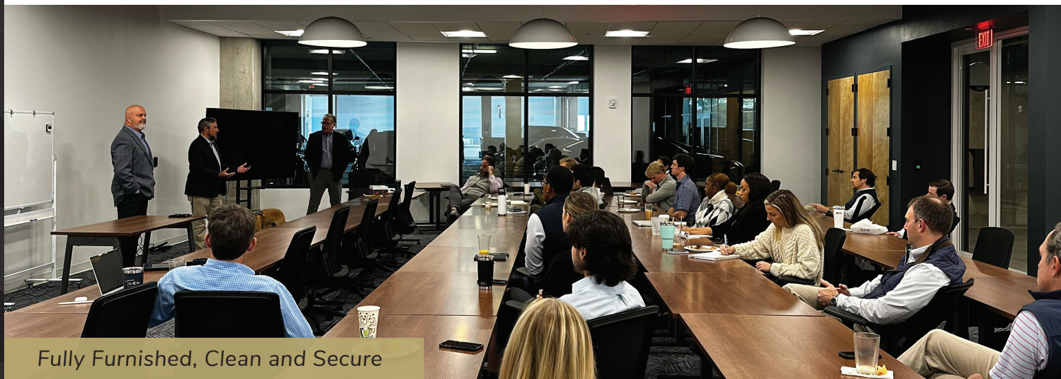
Fully Furnished, Clean and Secure