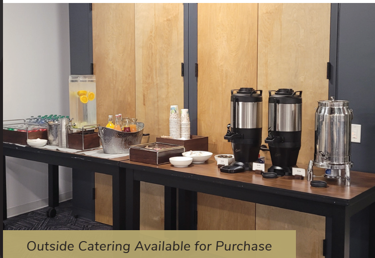
Outside Catering Available for Purchase