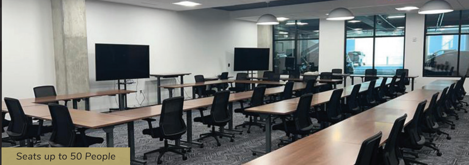
Seats up to 50 People

located on the 3rd floor of West Midtown's The Interlock