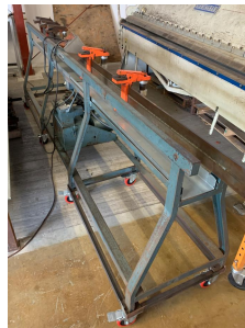
Brand: The lockformer Company.