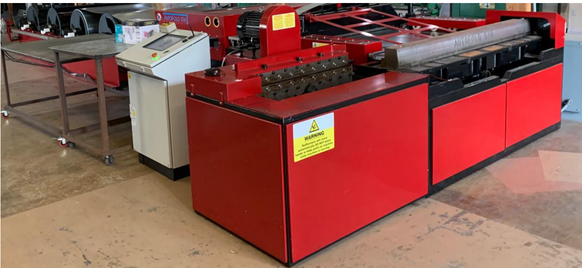
Brand: Advance cutting / Autofold 516.