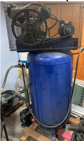
Brand: CAMELL HAUSFELD, model DP581000AJ.