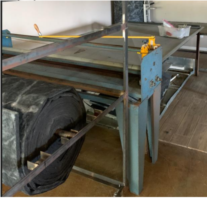
Brand: DURO DYNE.