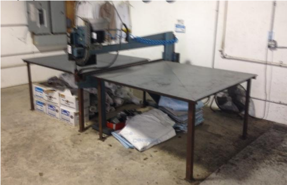
Model: DURO DYNE.