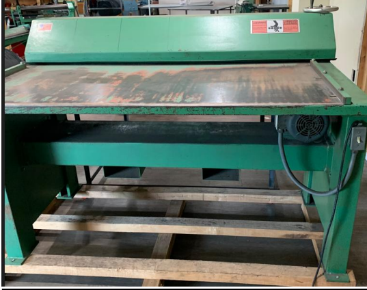
Brand: TIN KNOCKER, model 1660.