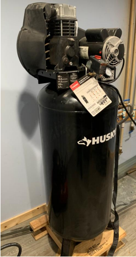
Brand: Husky model c60214 f/n3004181.