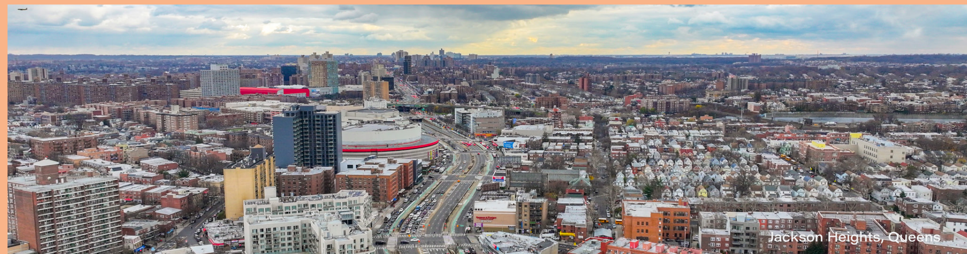
Jackson Heights, Queens