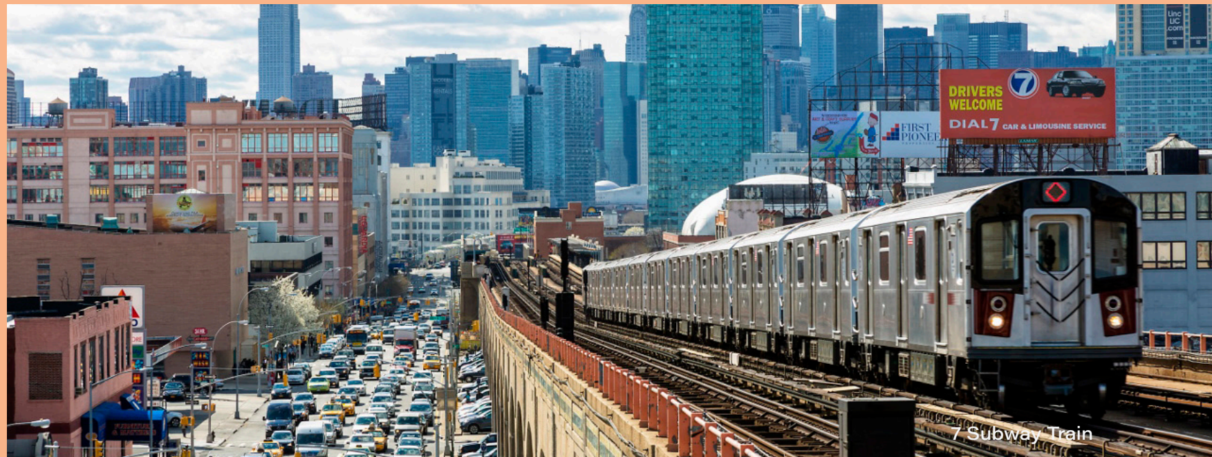
7 Subway Train