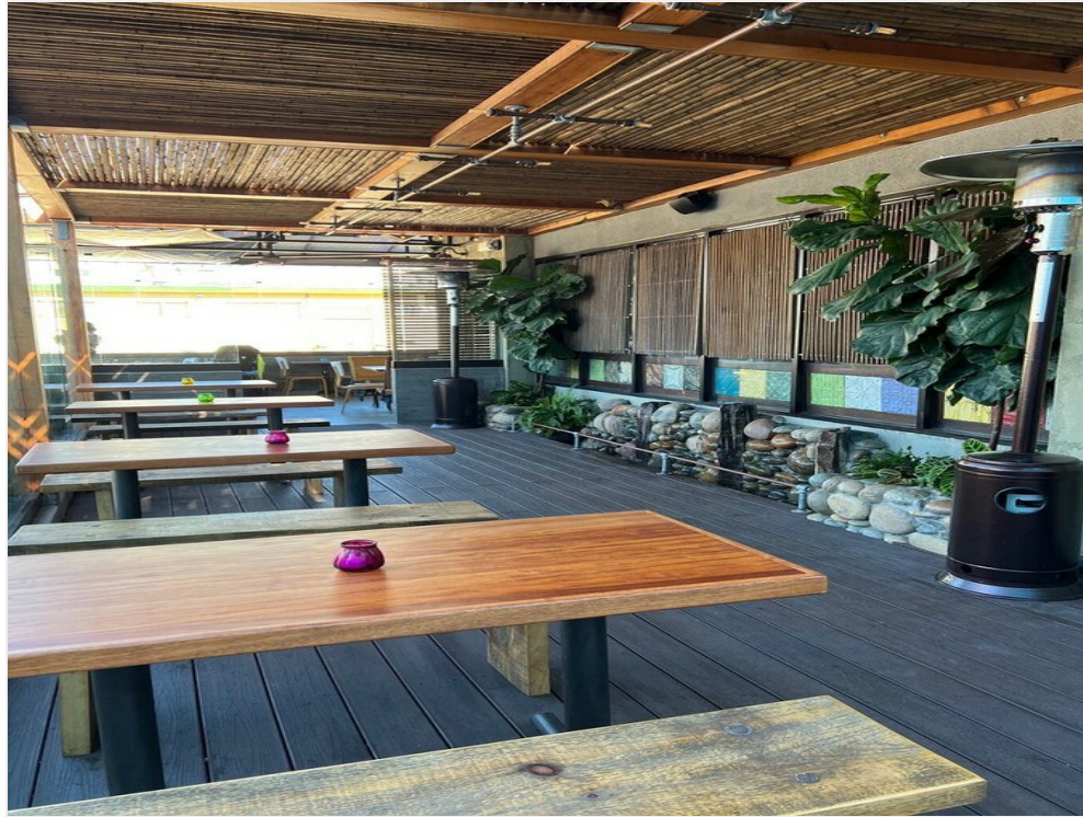
Entry Patio Seating Area