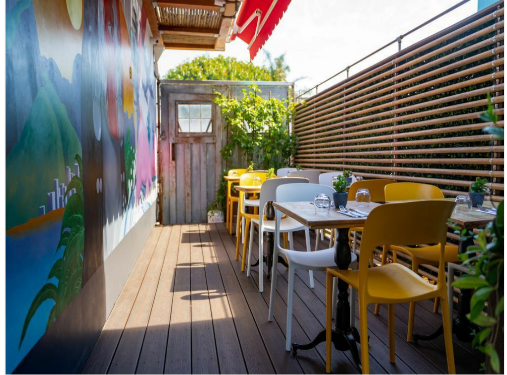
Rear Side Patio