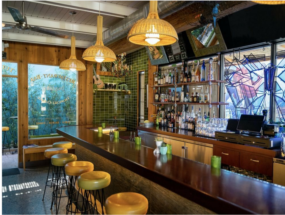
Bar at Entry