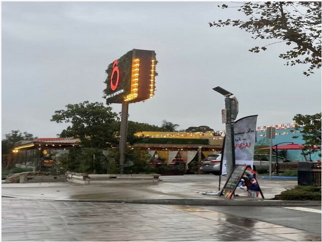
Exterior Front Corner