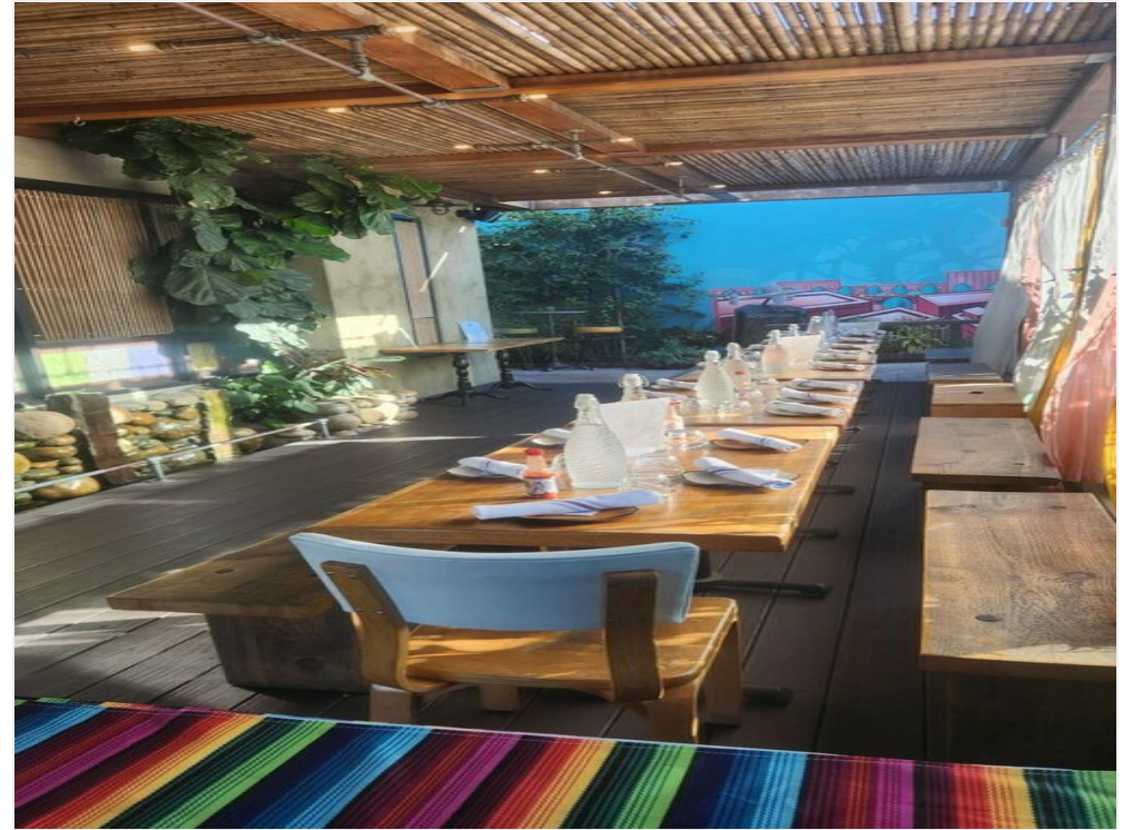
Front Patio Party