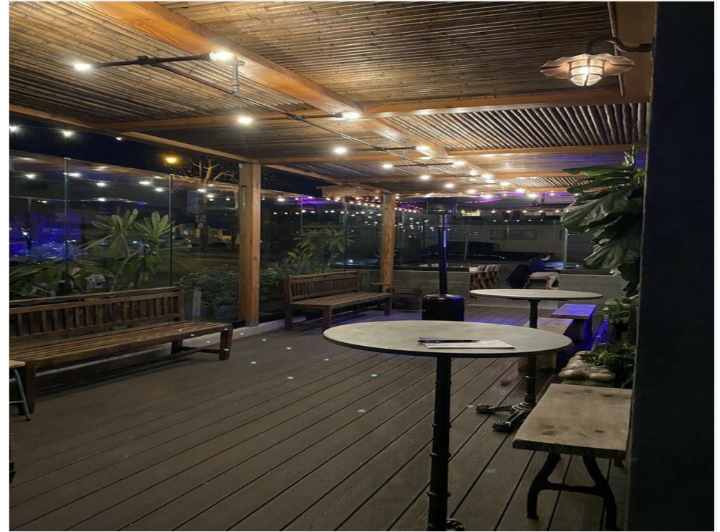
Front Patio Event