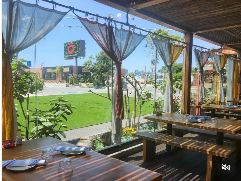
Front Patio Corner