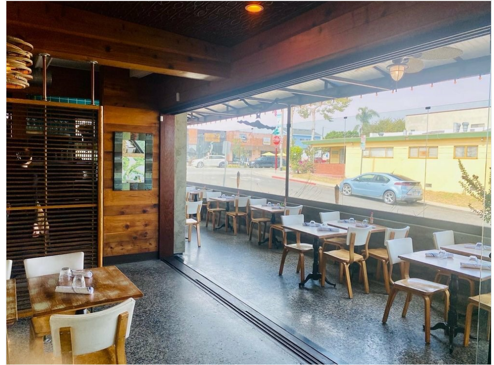
Pine Avenue Patio