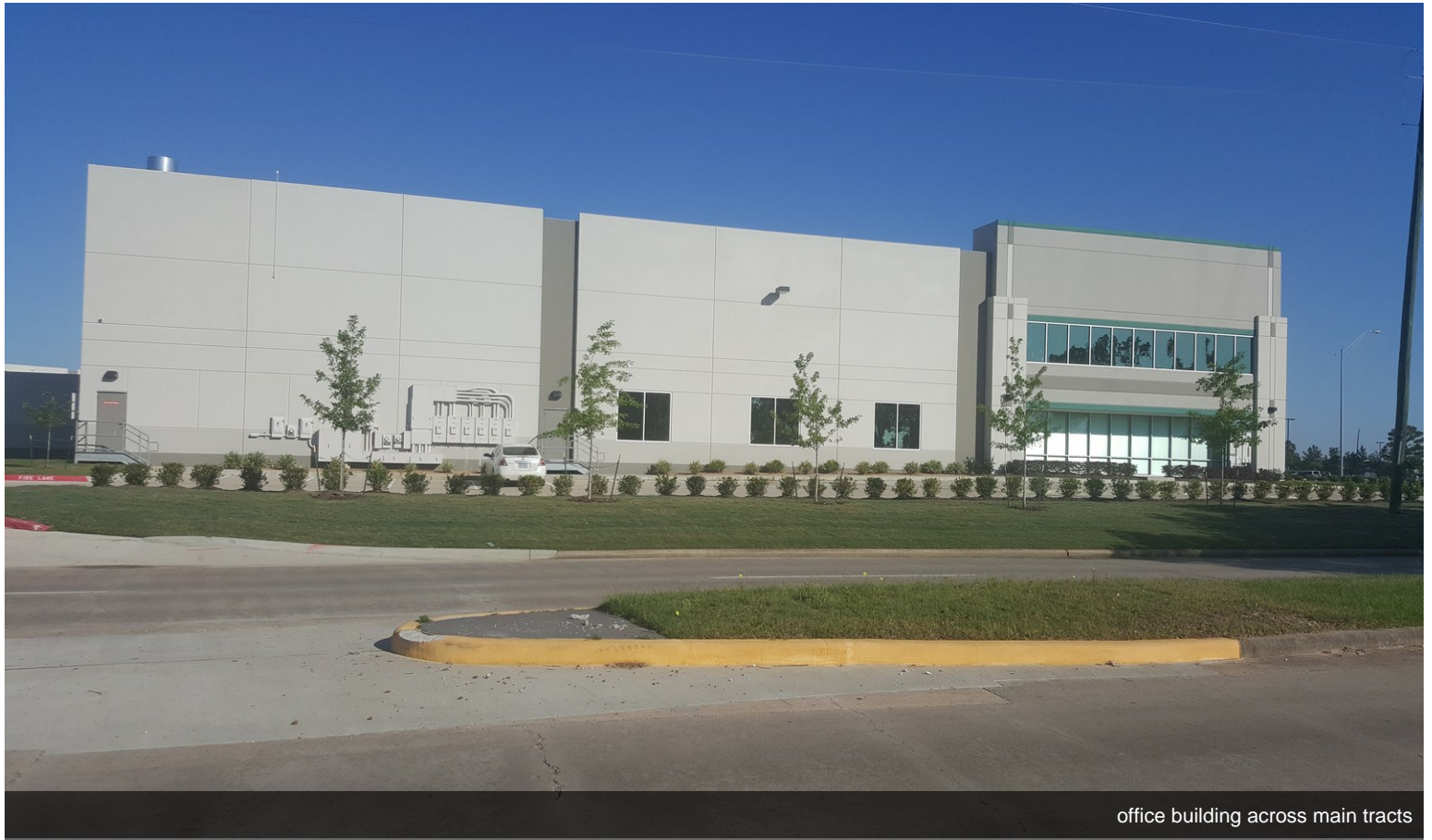
office building across main tracts