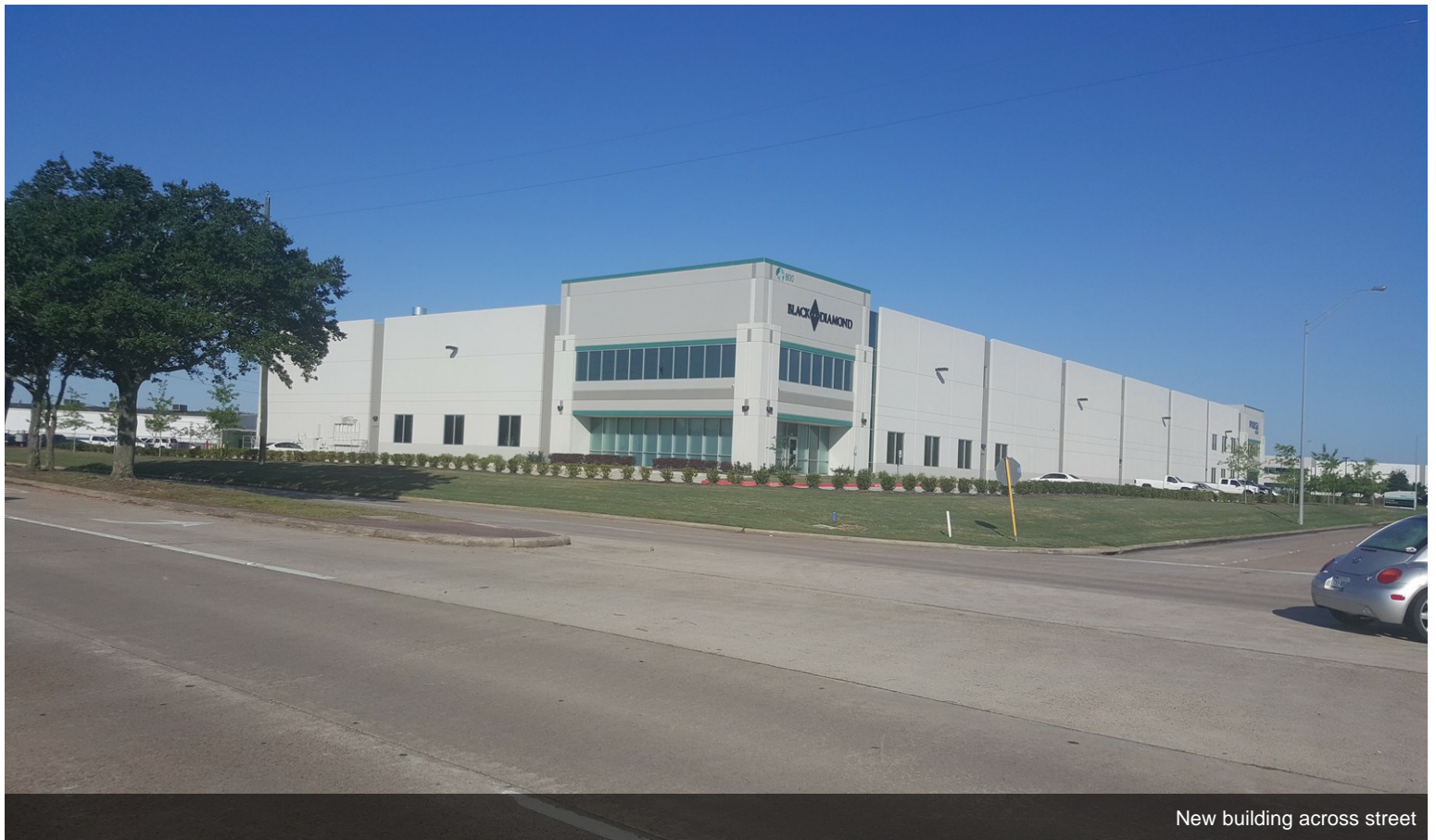
New building across street