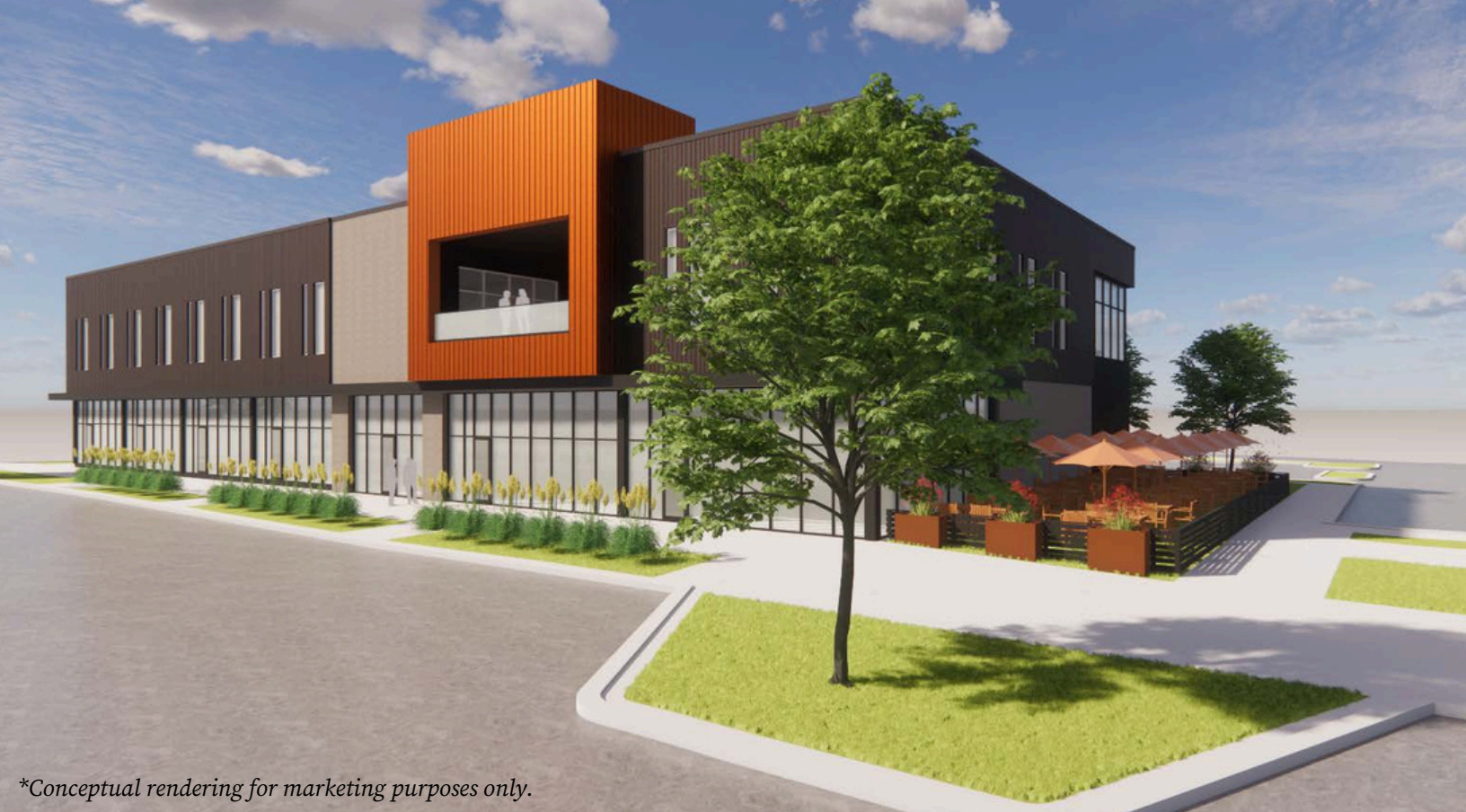
*Conceptual rendering for marketing purposes only.