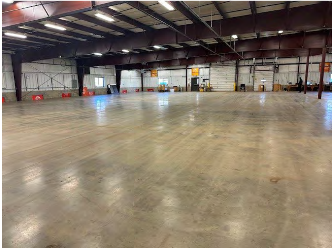
2014 Expansion Photos