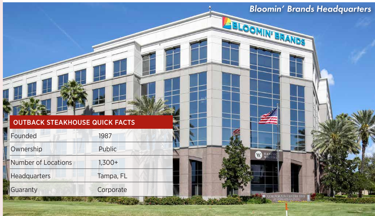
Bloomin' Brands Headquarters