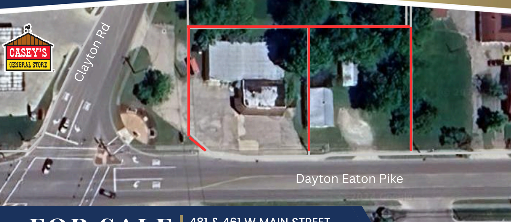
Dayton Eaton Pike