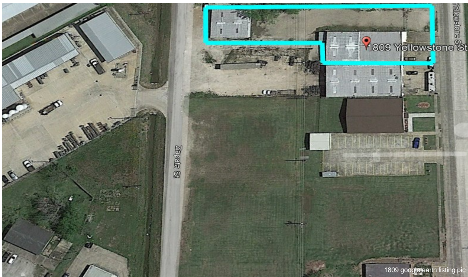
1809 google earth listing pic