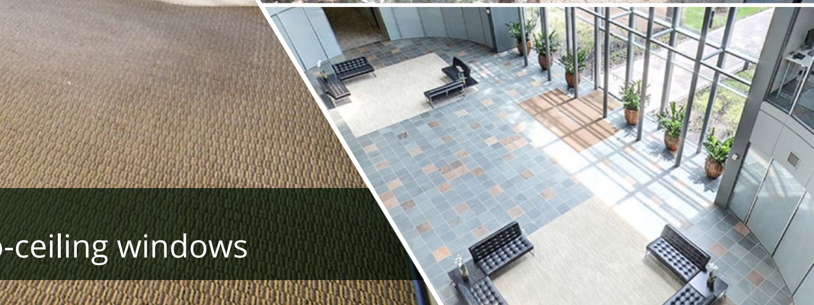
SUITE 300 \ 10,943 SF Corner office with floor-to-ceiling windows