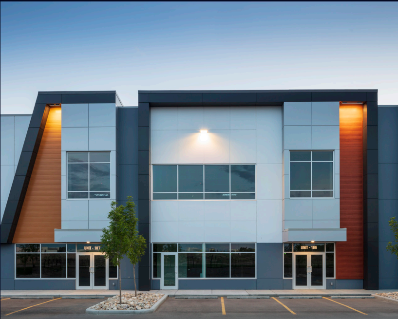
Evolve at District | Calgary, AB

The industrial condominium ("condo") ownership model is well regarded and in high demand in both Alberta and British Columbia. Having successfully completed more than 70 industrial condo projects, Beedie has a long track record of award-winning developments and very satisfied clients. For small to medium-sized businesses, condo ownership provides the opportunity to own commercial real estate in a professionally managed development. This allows for excellent maintenance of the real estate asset and carefree ownership for the operating business, while building equity. From the selection of the site location to the completed development, every aspect is carefully considered. Beedie projects are designed and constructed to provide owners with high-quality, efficient, well thought-out units. Over the past decade, Beedie has worked with local businesses and watched them grow – from being tenants, to purchasing their first condo unit, to owning multiple condo units and eventually, developing custom built-to-suit facilities. This is one of many reasons why Beedie is committed to the industrial condo program and developing these state-of-the-art projects across Canada.