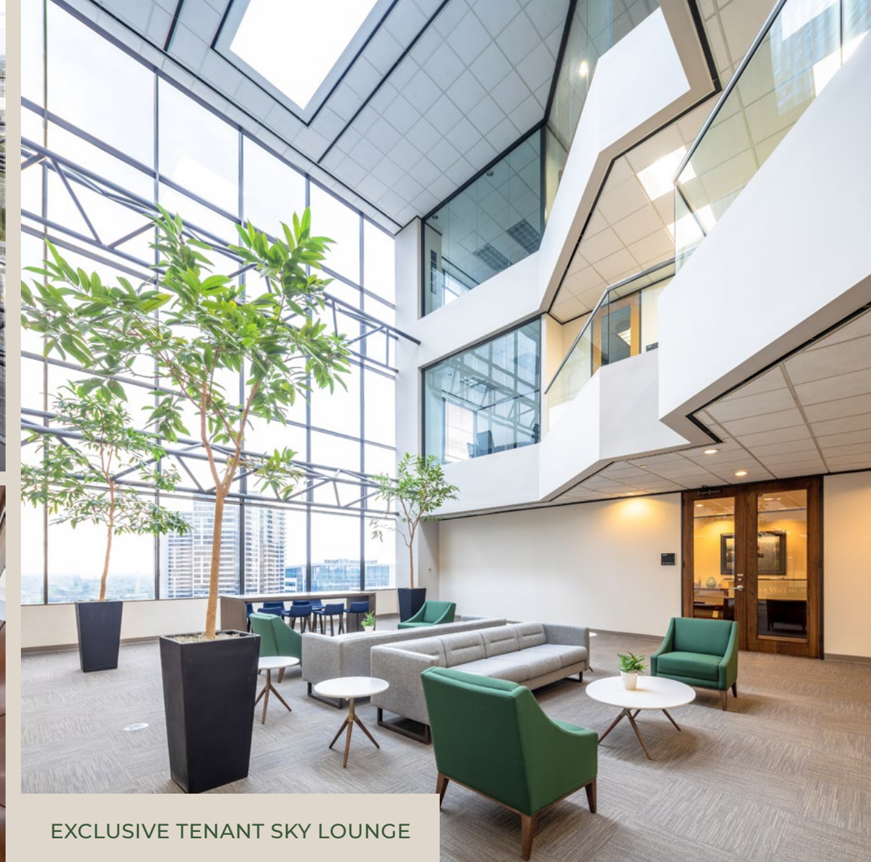
EXCLUSIVE TENANT SKY LOUNGE