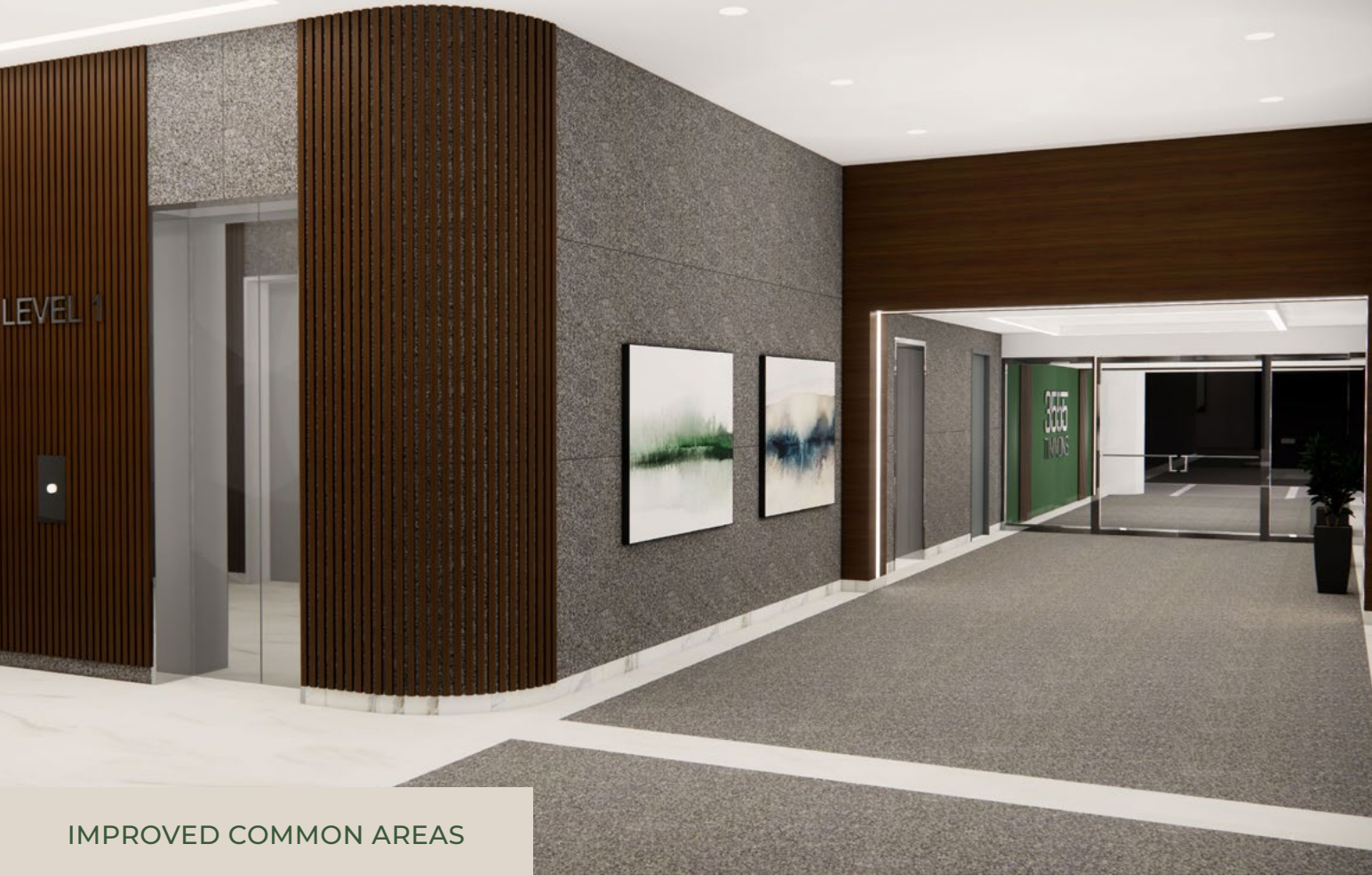
IMPROVED COMMON AREAS