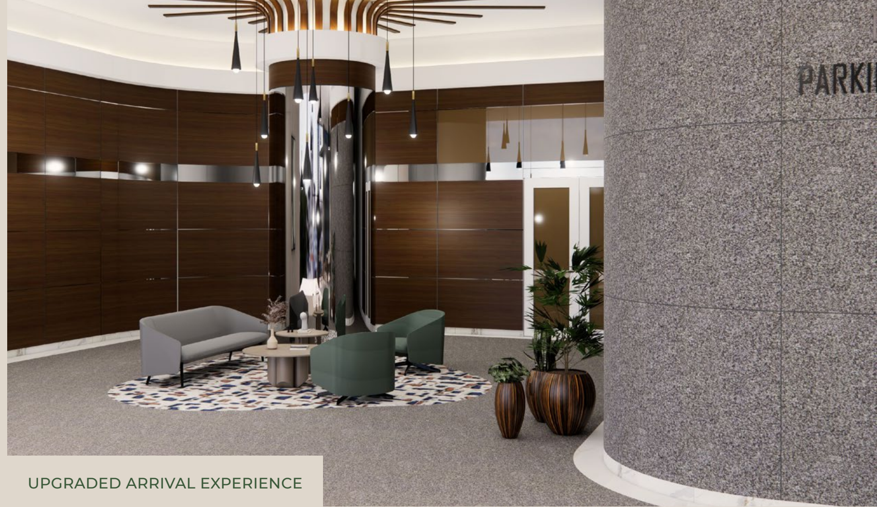
UPGRADED ARRIVAL EXPERIENCE