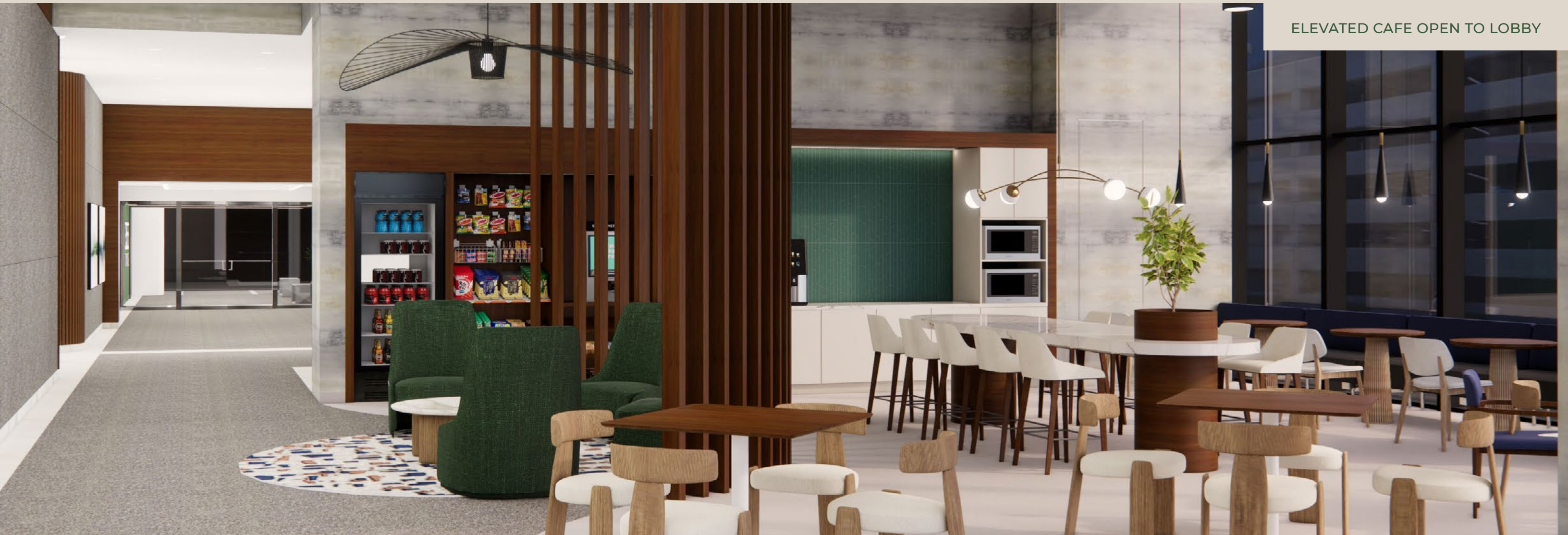
ELEVATED CAFE OPEN TO LOBBY