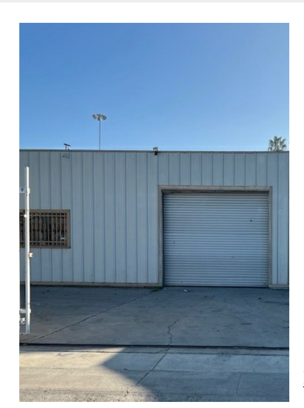
1724 W 2nd St 1724 W 2nd St, Santa Ana, CA 92703