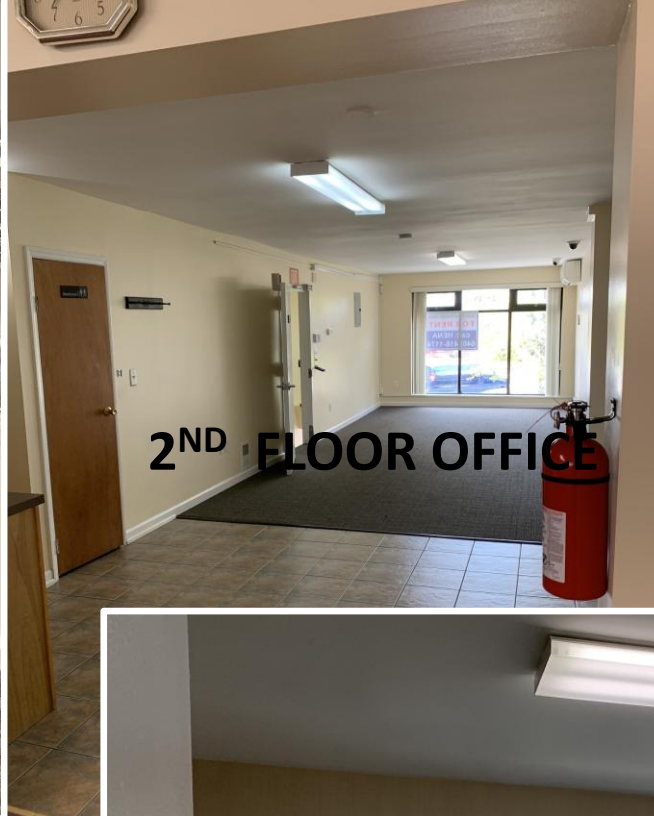
2 ND FLOOR OFFICE