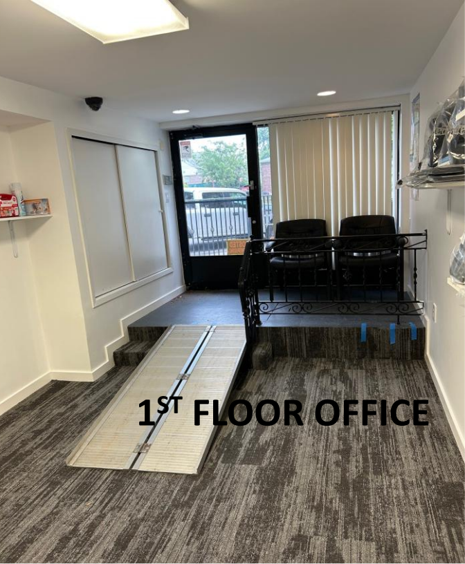
1 ST FLOOR OFFICE