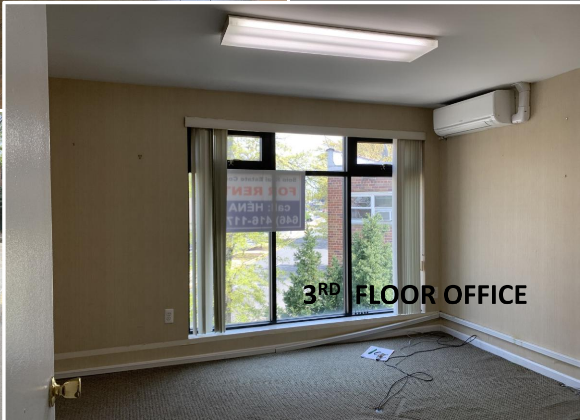
3 RD FLOOR OFFICE