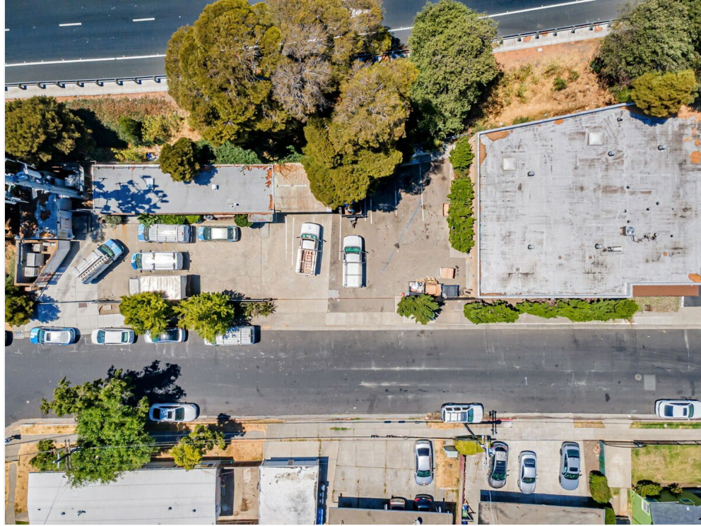
1537 S 56th St