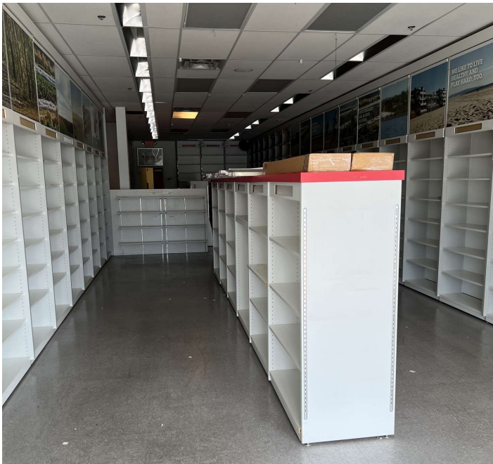
View looking into the space from the front door