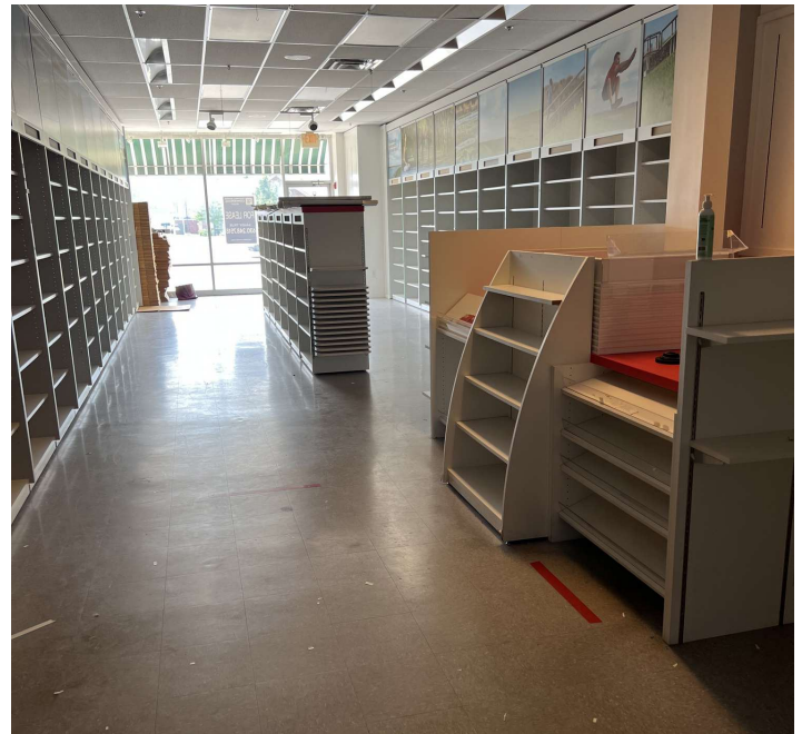
View looking out the space from the rear of the store.