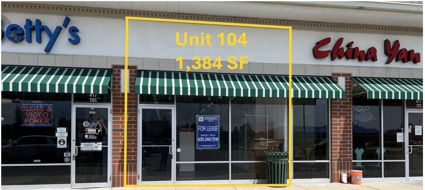
Unit 104 - 1,384 SF - Former GNC space