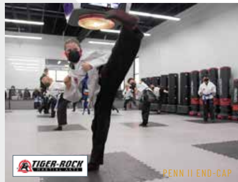
PENN II END-CAP