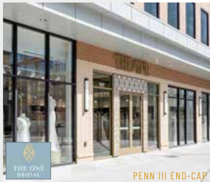
PENN III END-CAP