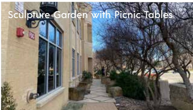
Sculpture Garden with Picnic Tables