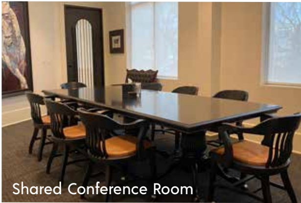
Shared Conference Room