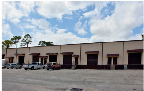
11239 ST. JOHNS INDUSTRIAL PKY