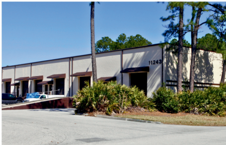
11243 ST. JOHNS INDUSTRIAL PKY