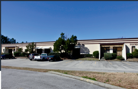
11232 ST. JOHNS INDUSTRIAL PKY