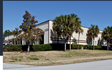
11233 ST. JOHNS INDUSTRIAL PKY