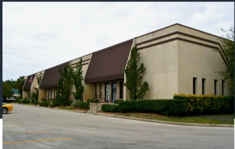
11222 ST. JOHNS INDUSTRIAL PKY