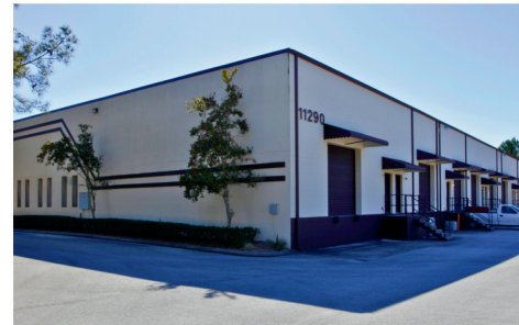
11290 ST. JOHNS INDUSTRIAL PKY