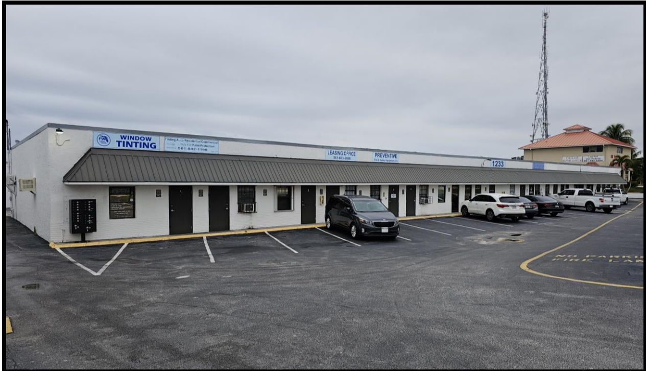
1233 OLD DIXIE HIGHWAY, LAKE PARK, FLORIDA 33403