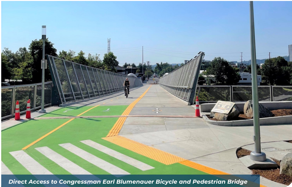
Direct Access to Congressman Earl Blumenauer Bicycle and Pedestrian Bridge