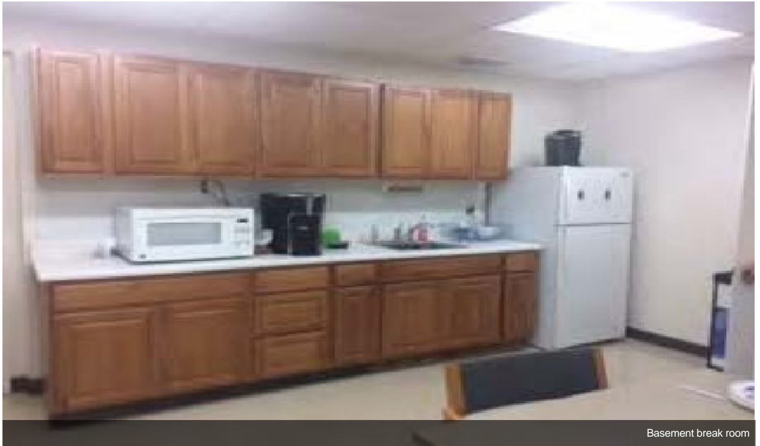
Basement break room