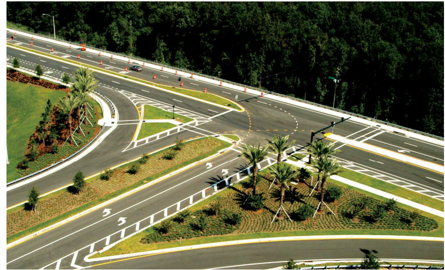
Midpoint Commerce Park