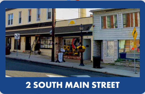
2 SOUTH MAIN STREET