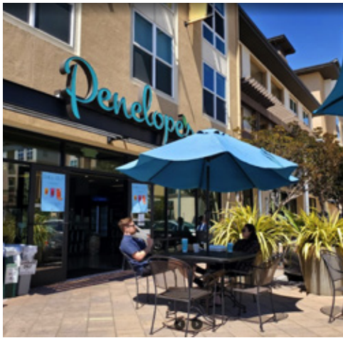
PENELOPE'S COFFEE AND TEA