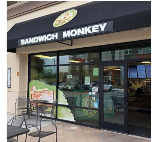
THE SANDWICH MONKEY