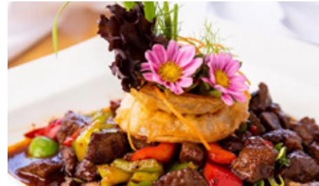
SWEET BASIL THAI CUISINE