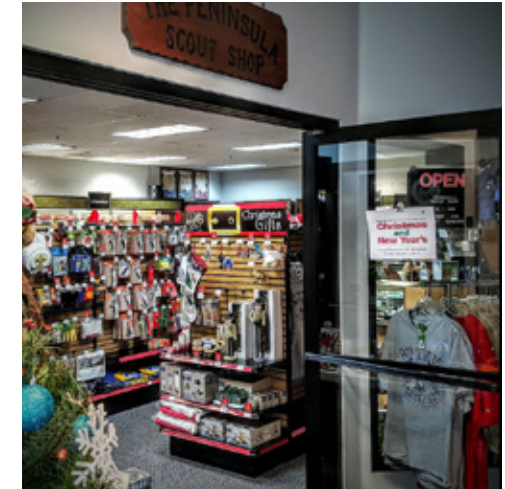
PENINSULA SCOUT SHOP