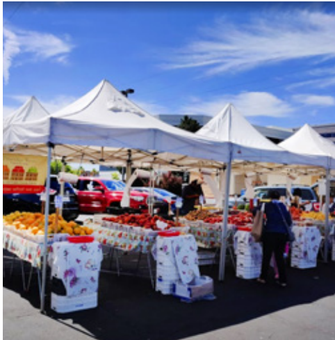
FOSTER CITY FARMER'S MARKET