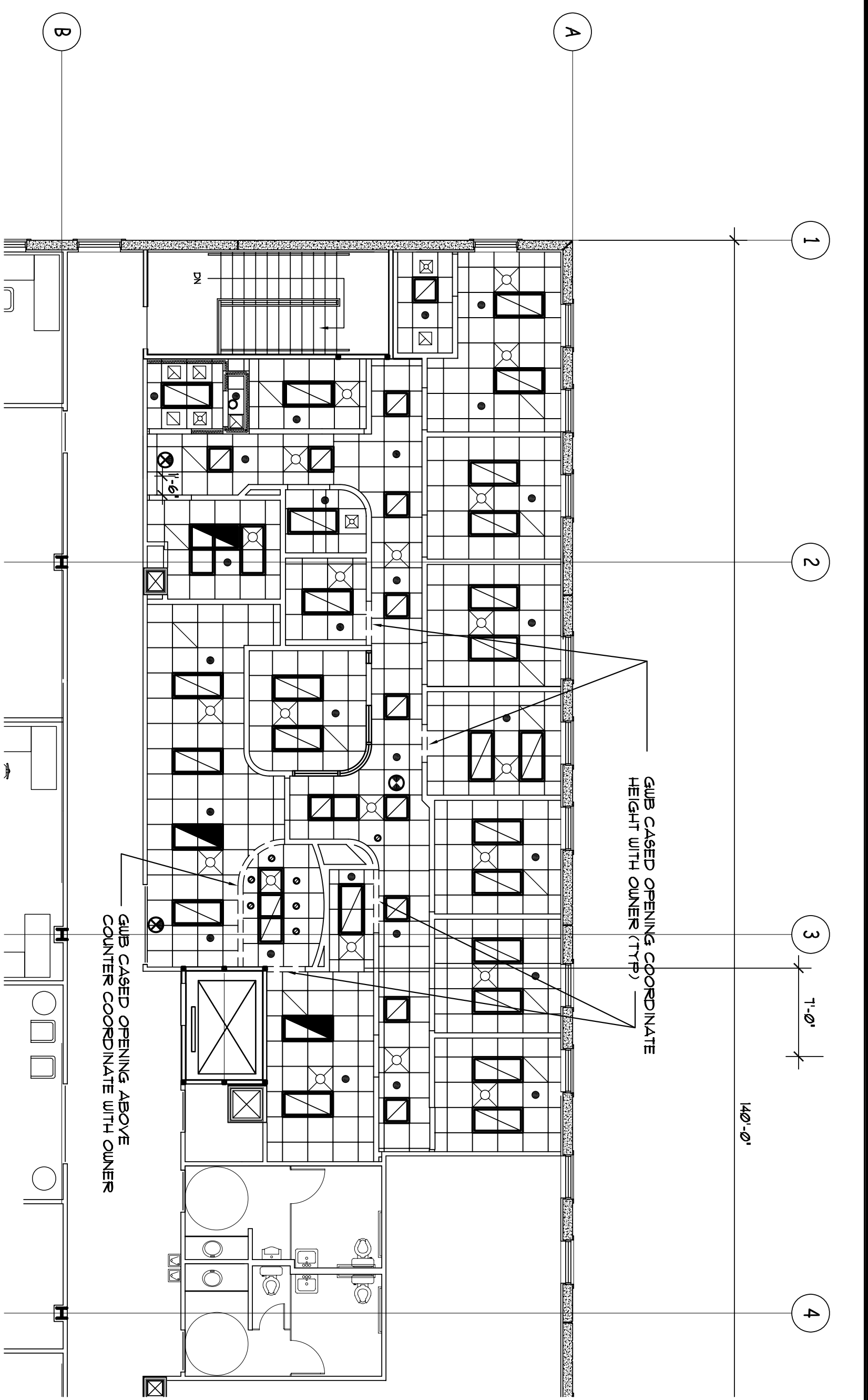
TENANT 310 REFLECTED CEILING PLAN SCALE: 1/8" = 1'-0"