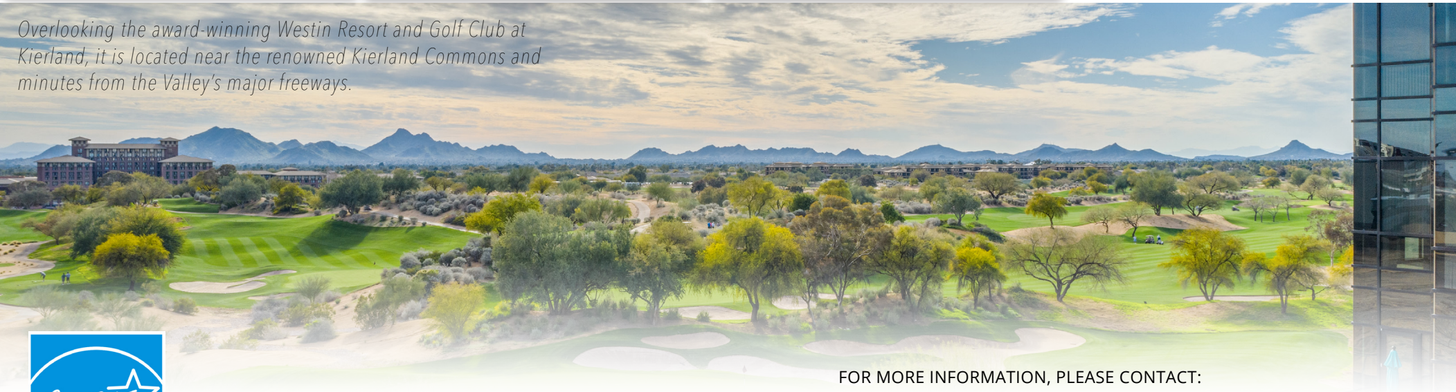
Overlooking the award-winning Westin Resort and Golf Club at Kierland, it is located near the renowned Kierland Commons and minutes from the Valley's major freeways.