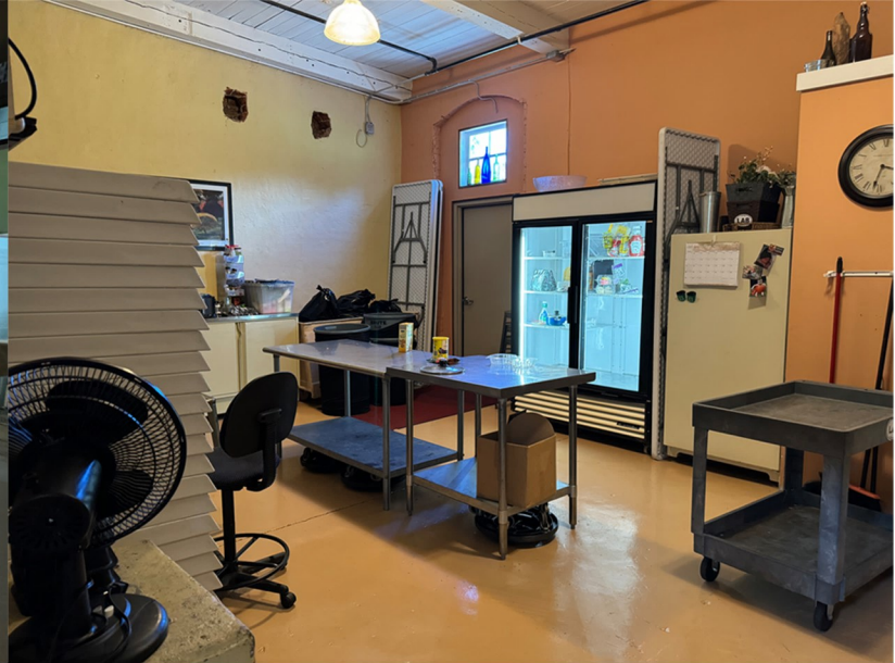
UPPER LEVEL KITCHEN SPACE