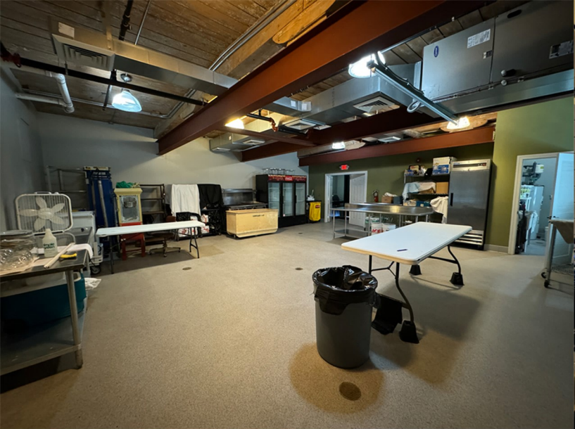
LOWER LEVEL KITCHEN SPACE