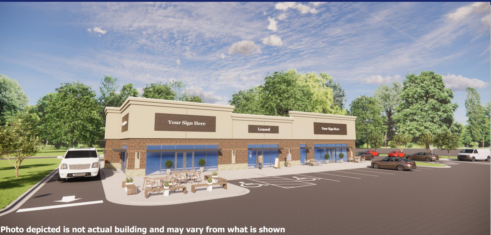
Photo depicted is not actual building and may vary from what is shown