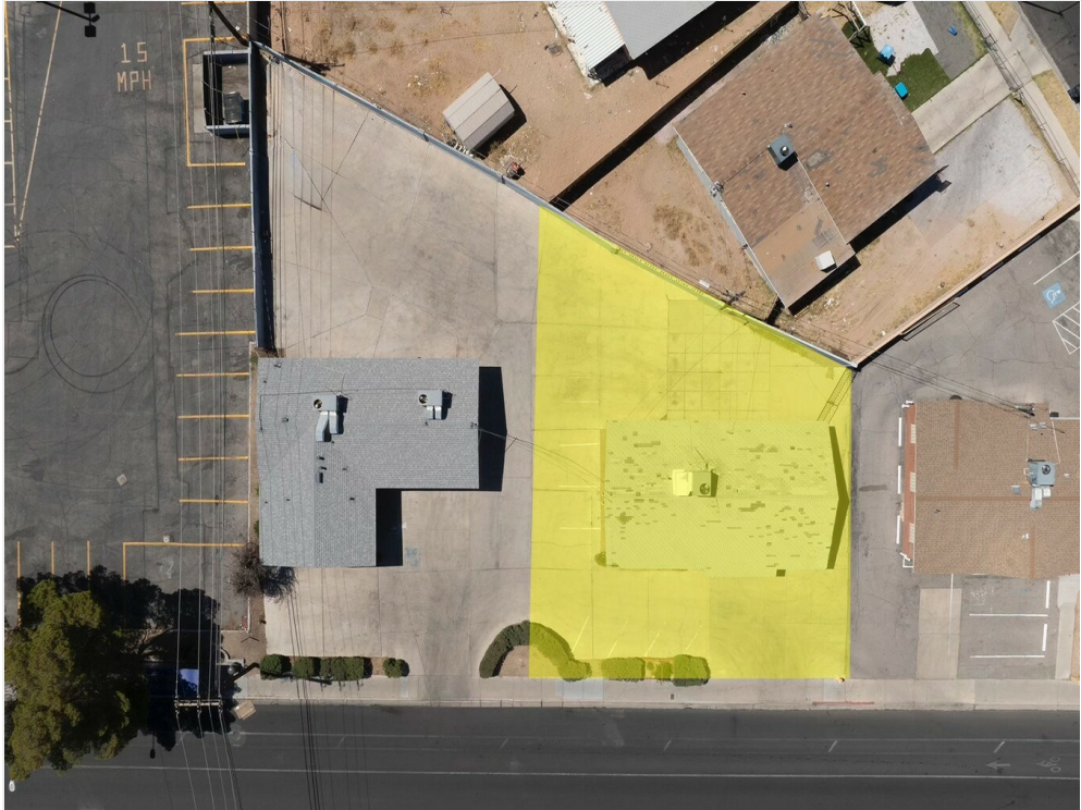
5021 Alta 1