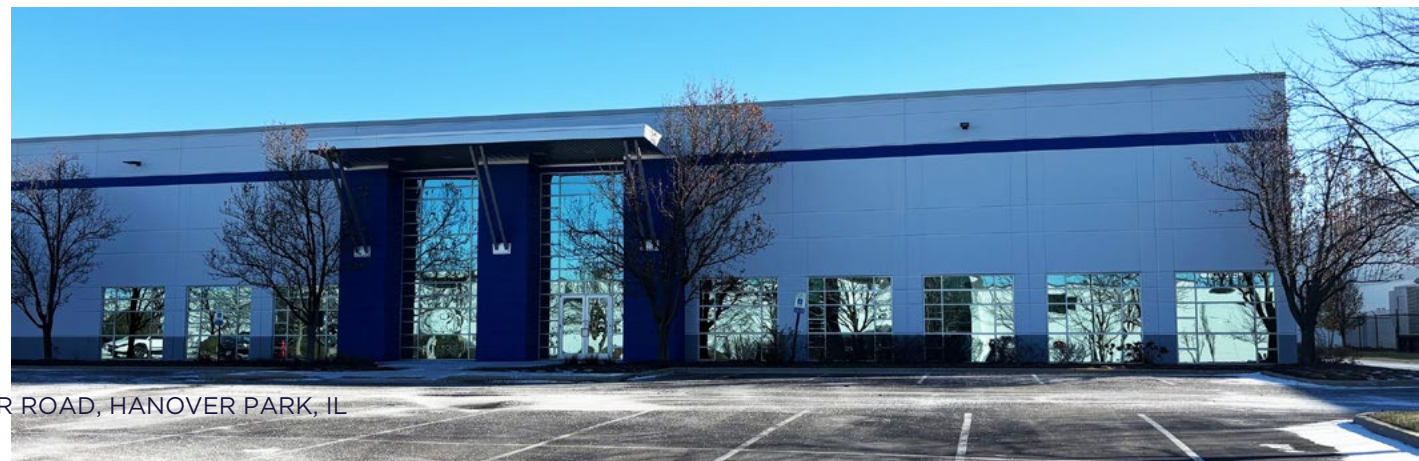
HANOVER CORPORATE CENTER II | 1555 HUNTER ROAD, HANOVER PARK, IL