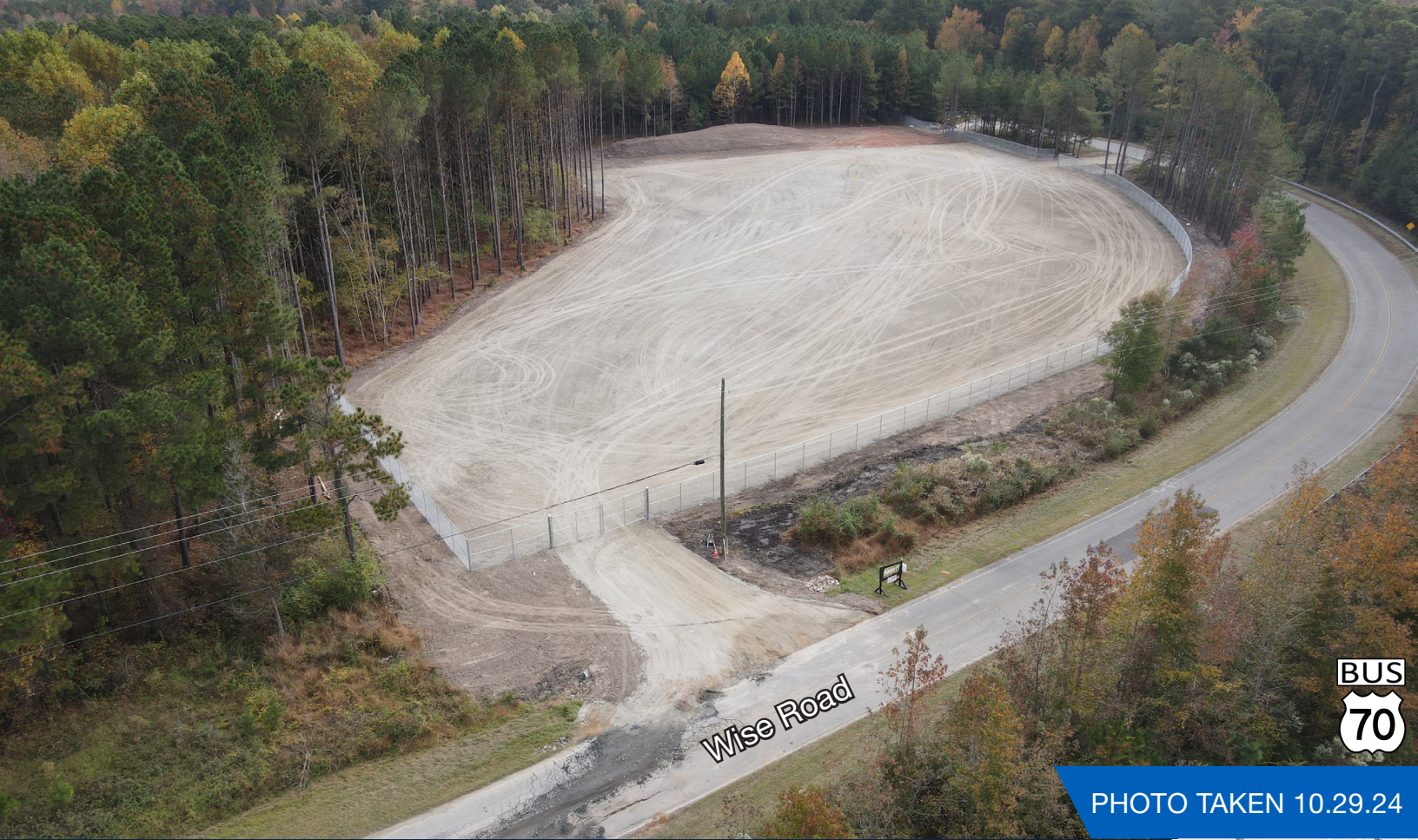
PHOTO TAKEN 10.29.24