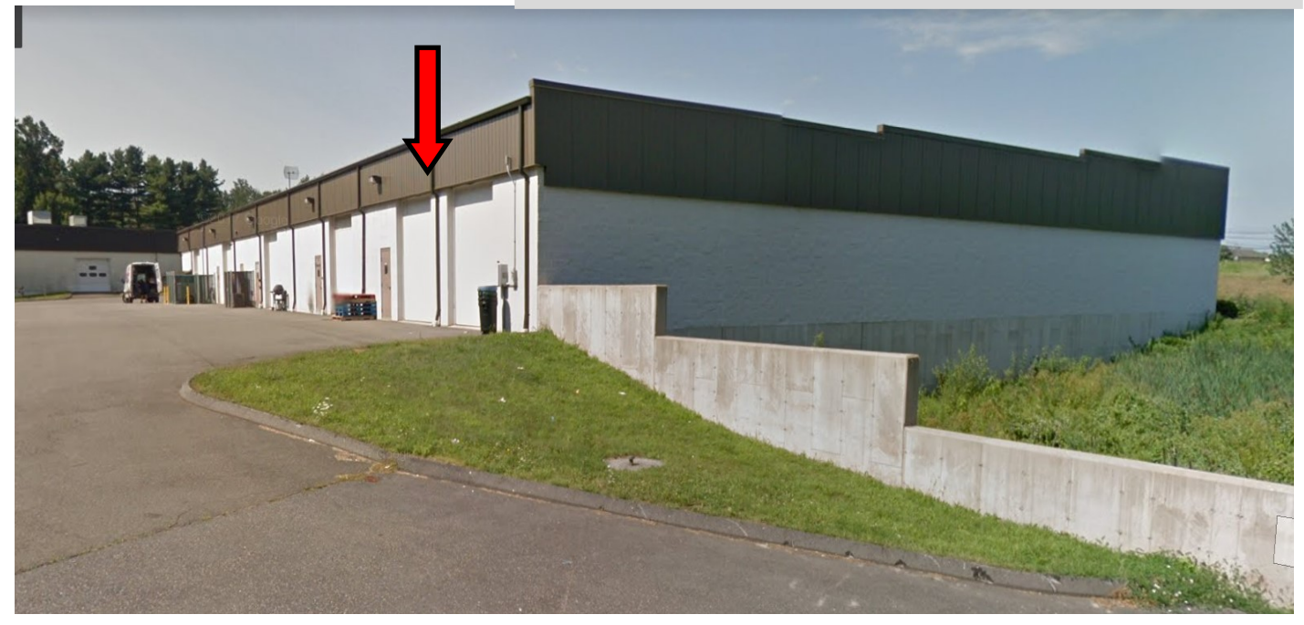
All information furnished is from sources deemed reliable and is submitted subject to errors, omissions, change of other terms of conditions, prior sale, lease or financing or withdrawal-all without notice. No representation is made or implied by Godin Property Brokers, LLC or its associates as to the accuracy of the information submitted herein.

5,092 S/F Modern Industrial Space 1,000 S/F Office Space + 1,000 S/F Mezzanine 16' Clear Span Ceilings 2 Oversized Drive in Doors (10 x 12) Full Central A/C Super Clean Space Lease Asking $12 PSF Gross + Utilities