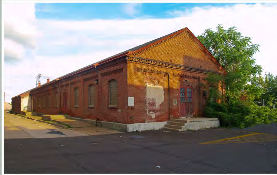
Building #222 11,299 Square Feet