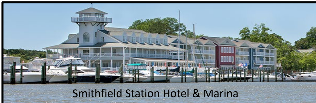
Smithfield Station Hotel & Marina

Recreational opportunities, historic sites, and the town of Smithfield drive tourists to Isle of Wight County, 43% of whom come from out of state, generating a total economic impact of over $58 million in 2021. Smithfield is routinely cited as one of the Most Beautiful Small Towns in Virginia. See https://www.onlyinyourstate.com/virginia/small-towns-va/ . Those tourists and locals generate combined average daily traffic of 38,450 Vehicles Per Day at the intersection of Benns Church Blvd and Brewers Neck Blvd. The property will enjoy even greater traffic generated by the recently approved Riverside Smithfield Hospital, that will share the intersection with the subject property. See https://www.riversideonline.com/about/riverside-smithfield-hospital