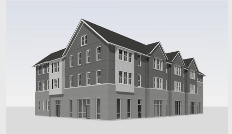
Building A Floorplan