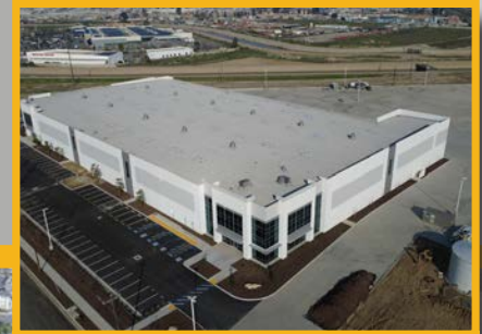
2204 Coffee Road