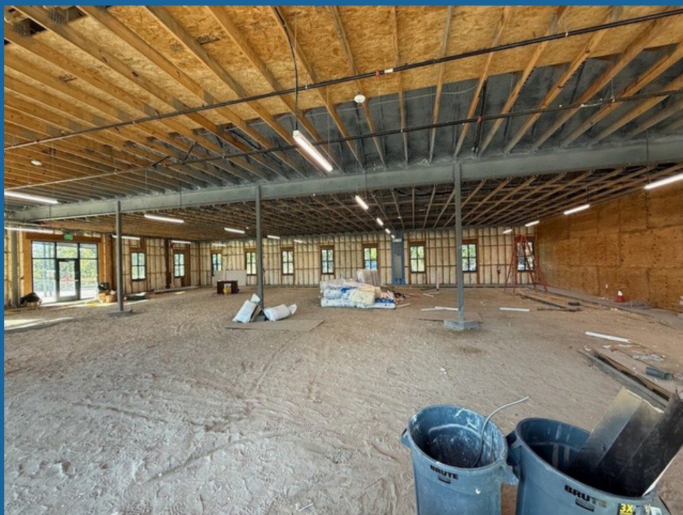
View Towards End Unit