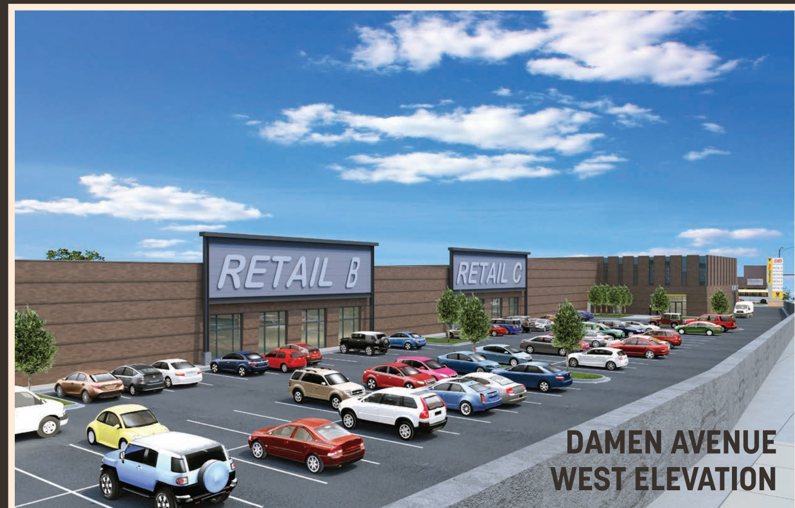
DAMEN AVENUE WEST ELEVATION