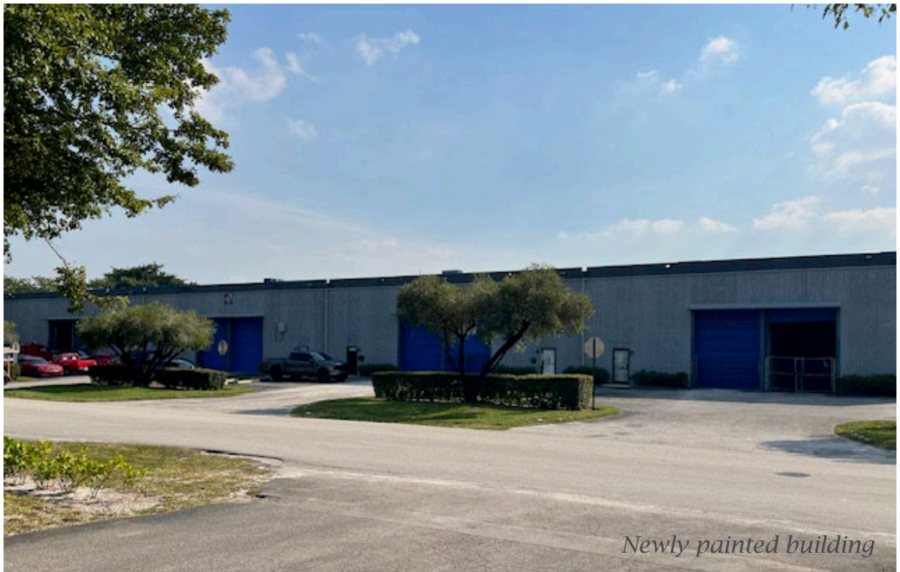
Newly painted building

For more information or to schedule a tour please contact: