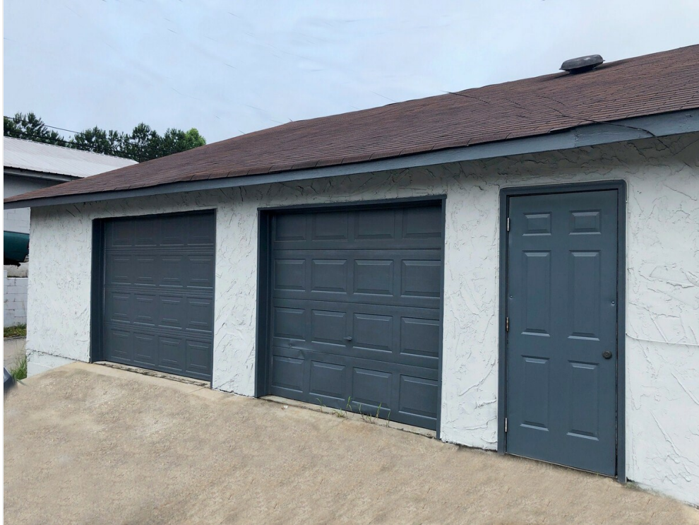
Rear garage of front building