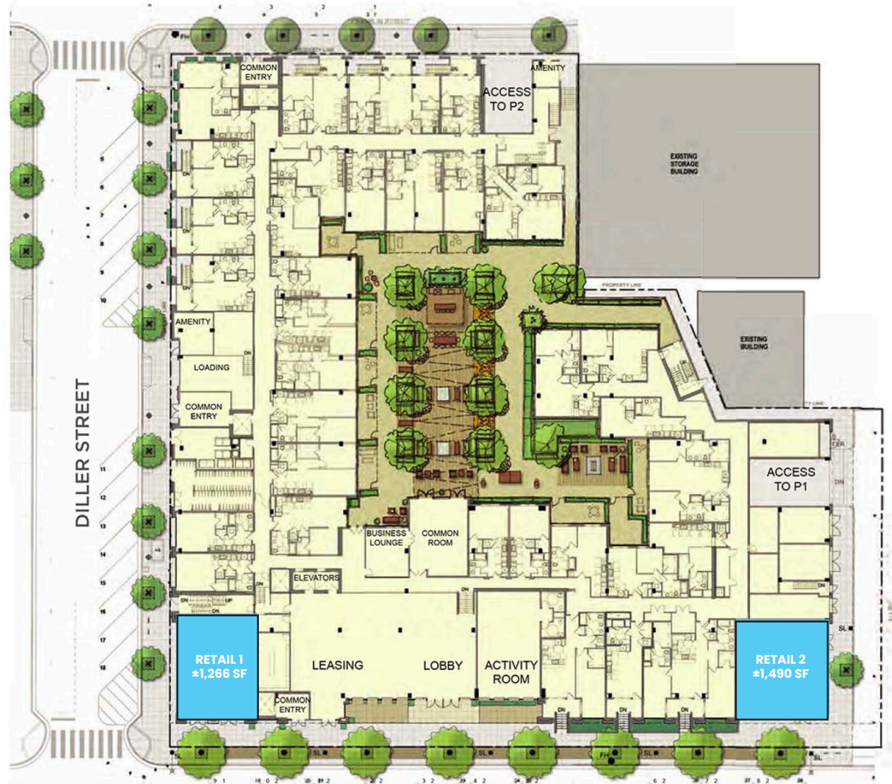
EL CAMINO REAL