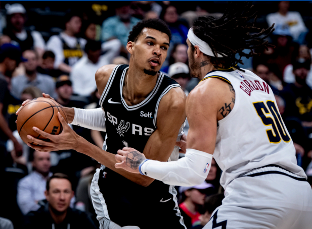
SAN ANTONIO SPURS