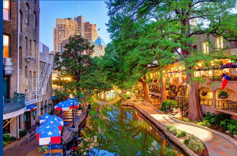
SAN ANTONIO RIVERWALK