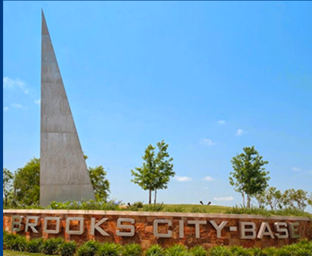
BROOKS CITY BASE