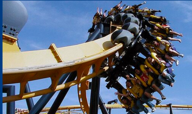
SIX FLAGS OVER TEXAS FIESTA TEXAS