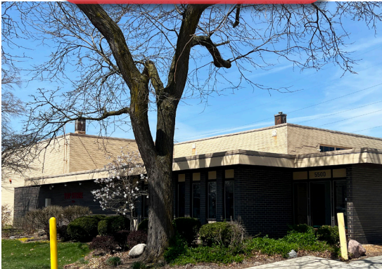
5500-5520 McDermott Dr