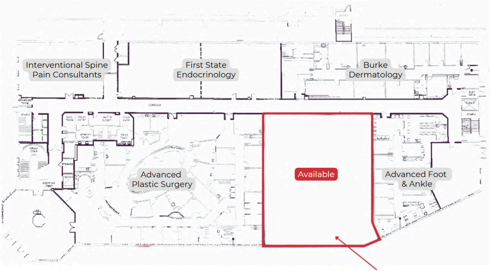
Suite 103 - 5,000 SF