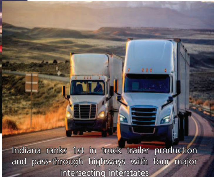
Indiana ranks 1st in truck trailer production and pass-through highways with four major intersecting interstates