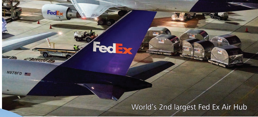
World's 2nd largest Fed Ex Air Hub

Indianapolis: Centrally located with award-winning infrastructure for maximum logistical benefit