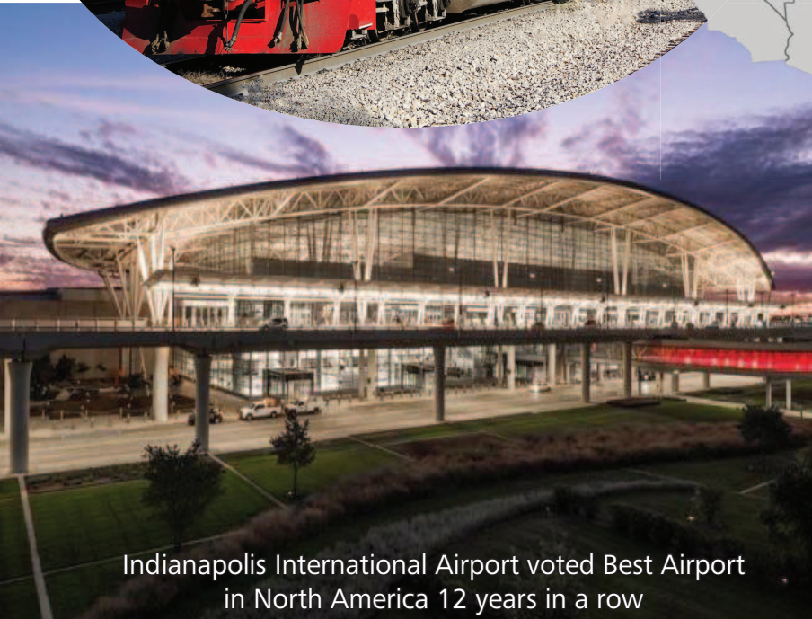
Indianapolis International Airport voted Best Airport in North America 12 years in a row